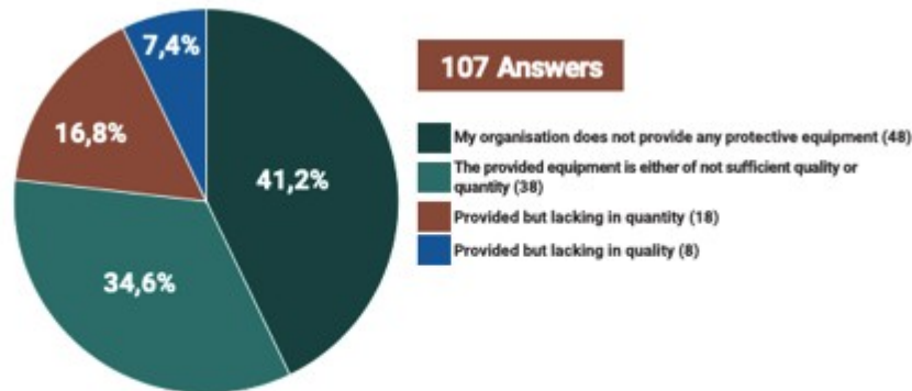
Graph-1: Survey responses- "Does the organization you work for provide you with personal protective equipment?" (Active journalists)

Access to PPE: The survey asked "Does the organization you work for provide you with personal protective equipment?" to which 107 active journalists responded; of these journalists 36.6% stated the organization they work for provided them with sufficient equipment in quality and quantity while 24.2% stated the equipment lacked in quality or in quantity. A large segment of respondents (41.2%) stated their organization did not provide them with any kind of protective equipment.